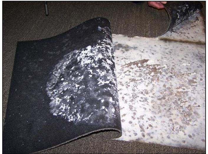
But it's not.