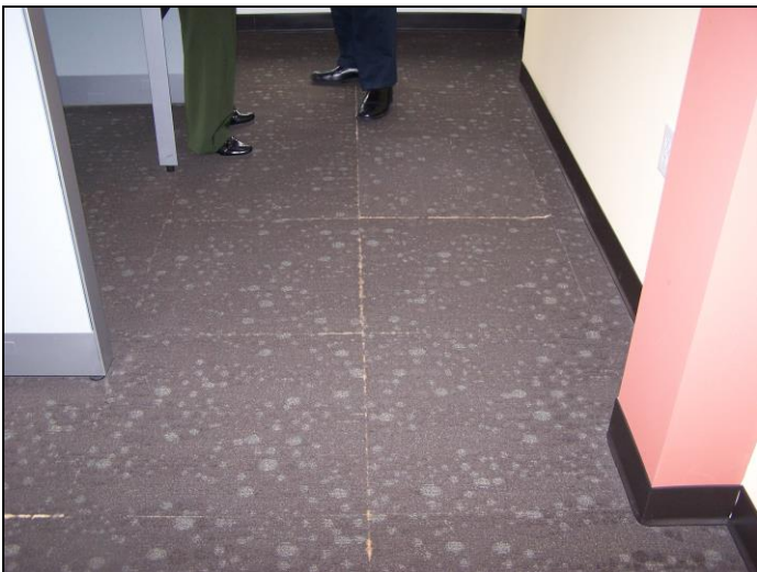
You may think it's the flooring...

Identifying what the problem is as specifically as possible is the first action that should be taken. Just what is the problem as best as can be identified? Normally the first thought is the flooring material itself is the problem because that's what can be seen – it's the flooring that's visibly manifesting the problem. This is understandable because most people really don't know what's wrong and that can include everyone from the manufacturer to the property owner and anyone in between who had anything to do with the project.