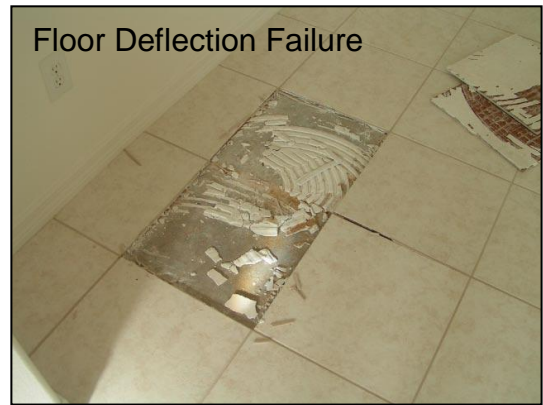
Floor Deflection Failure