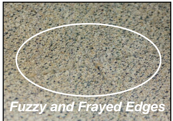
Fuzzy and Frayed Edges

Planar stability or flatness has been and continues to be a significant issue for every manufacturer of modular carpet. This has been the case from the inception of this type of floor covering product. Modular carpet by definition is carpet shipped and installed as small pieces of carpet. Each piece must be capable of performing as a unit and must be engineered to be not only flat, square and stable but to also be able to at least equal if not exceed all of the performance criteria required of carpet sold in roll form. Since each module will have four cut edges that will be butted to the cut edges of adjacent modules, with none of the seam sealing or other edge protection that is required on broadloom carpet, it is imperative that tuft bind strength be excellent. Failure to achieve this will lead to fuzzy and frayed edges with use.