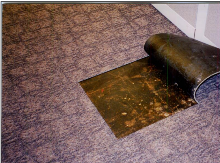
Example of severe substrate issue (cut back adhesive) but the carpet tiles are still laying flat.