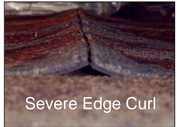
Severe Edge Curl