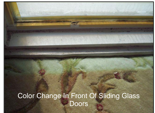
Color Change In Front Of Sliding Glass Doors

What's the problem here and why don't the products you sell in some situations live up to the expectations of the people you sell them to? The problem is you, the person selling, specifying or representing the flooring product. Not knowing what the products are really capable of doing that you sell. Not qualifying the use of the product and the end user by not asking them questions. I love the saying, "If you don't ask, you don't get".