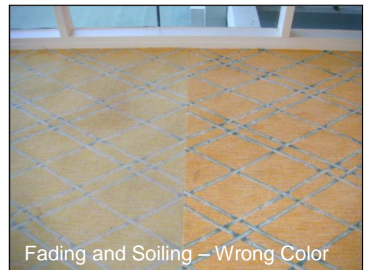
Fading and Soiling – Wrong Color