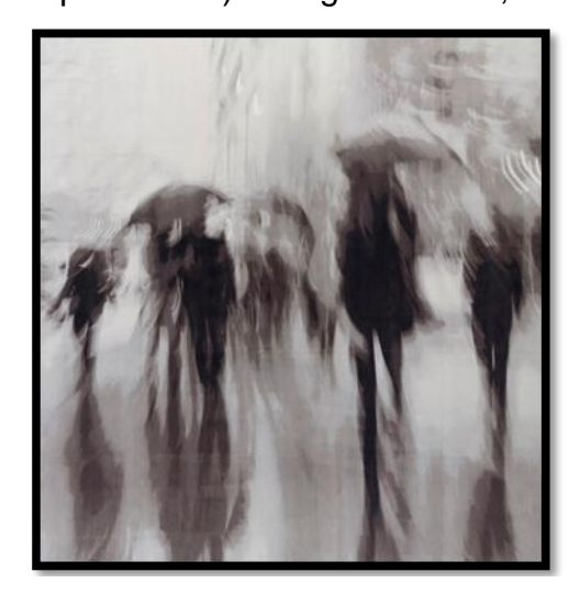
Introducing Moment, Milliken's newest floor covering collection. These image-based designs are comprised of colors and dimensions.

This is not to take away from the abilities of new high tech tufting machines, such as the Color Point machine that can create extraordinary patterns in all shapes, sizes and colors in cut and loop styles. Tufted carpet that is printed on can be made to look like virtually anything, from the surface of the moon to replication of works of art – realism to abstract. Essentially, whatever the mind's eye can conceive can be achieved in carpet; like never before. If you want unique, one of a kind carpet for a project you can have it. But remember, you're buying art for the floor not plain beige carpet.