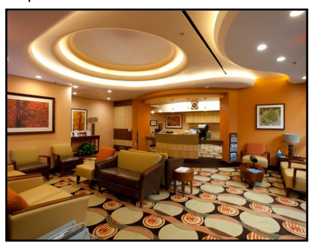
B Carpet - CYP - Donia Design