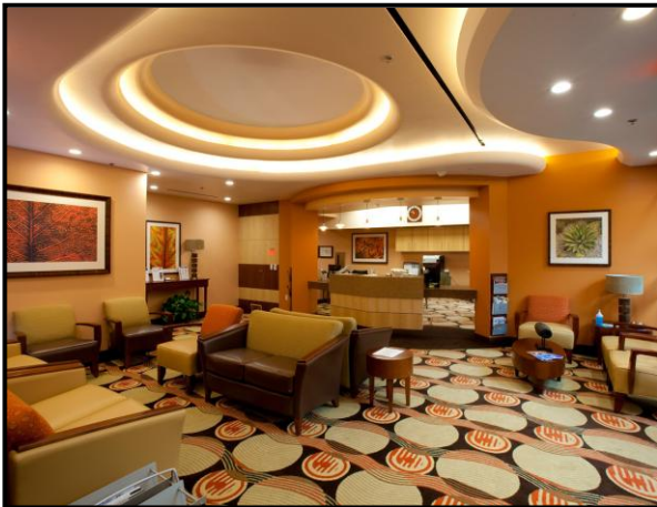
B Carpet – CYP – Donia Design