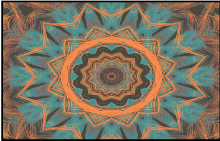
Brinton's Novae Collection

The Hospitality Design show in Las Vegas this year showcased a multitude of new designs in textile floorcovering materials. Never before has there been such a departure from the “normal” offerings of what many would consider high styled carpet and flooring. This move in design can be considered more art than design. These styles cover all means of manufacture of textile and hard surface flooring materials.