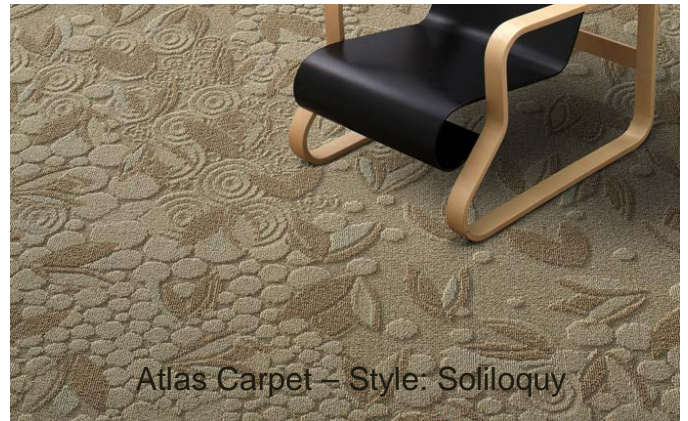
Atlas Carpet – Style: Soliloquy

Design: For all the marvelously beautiful flooring products on the market, particularly carpet, there remain a majority of fairly bland products. That's not to say everything has to be eye popping but a search of flooring manufacturer's websites reveals more dull than extraordinary. There are a couple of exceptions and the stand out is Atlas Carpet Mills, recently acquired by the Dixie Group. Not only does Atlas have the most highly styled, fashion oriented textile floor covering material but they have the best understanding of what style, fashion, color and texture mean and should be. You can almost walk into a facility that has an installation of Atlas carpet and tell it's theirs. And lest you think this is a paid endorsement of Atlas, they have no idea I'm writing about them. Just visit their website and then competitors and you'll see what I mean. And speaking of websites, which we will next, theirs has the best photos and clarity and ease of use. J & J has some good looking product as well, as does Mannington and a smattering of style from a few other manufacturers. It seems the bigger the manufacturer the less exciting the product is.