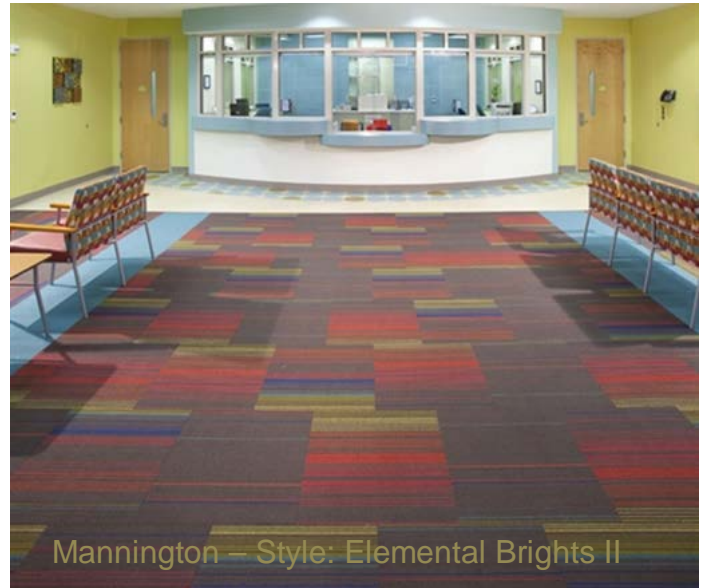
Mannington – Style: Elemental Brights II