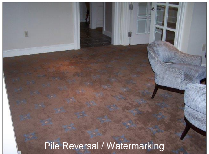
Pile Reversal / Watermarking

Pooling, Watermarking, Pile Reversal and Shading are manifested in different ways but primarily give the appearance of water having been spilled on a carpet causing irregularly shaped light and dark areas in or out of the traffic lanes of carpet. Shading is more a highlighting or a light and dark mottled appearance in a carpet, much like shading on suede material. Shading is normal for a cut pile carpet as the face yarn directions are altered by normal foot traffic and vacuum cleaner movement. More expensive woven wool or wool blend carpets are the most severely affected but the conditions can occur on nylon, polyester and polypropylene cut pile carpets as well. These conditions also don't discriminate against the type of manufacture of a carpet, be it woven, tufted or fusion bonded, nor whether it is broadloom or carpet tile. All of these terms refer to the shading or perceived color change and textural change effect that occurs when the pile in random or concentrated areas of the installed carpet undergoes a vertical re-orientation of the face yarns. This in turn causes light to be reflected off the ends or sides of the pile in different directions, thus creating the "shading" effect. This condition is much like the shading that can occur in suede or velvet upholstery fabric. No dense, high quality cut pile carpet or rug is immune to this condition whether it is hand or machine made and the condition appears almost exclusively in cut pile carpets.