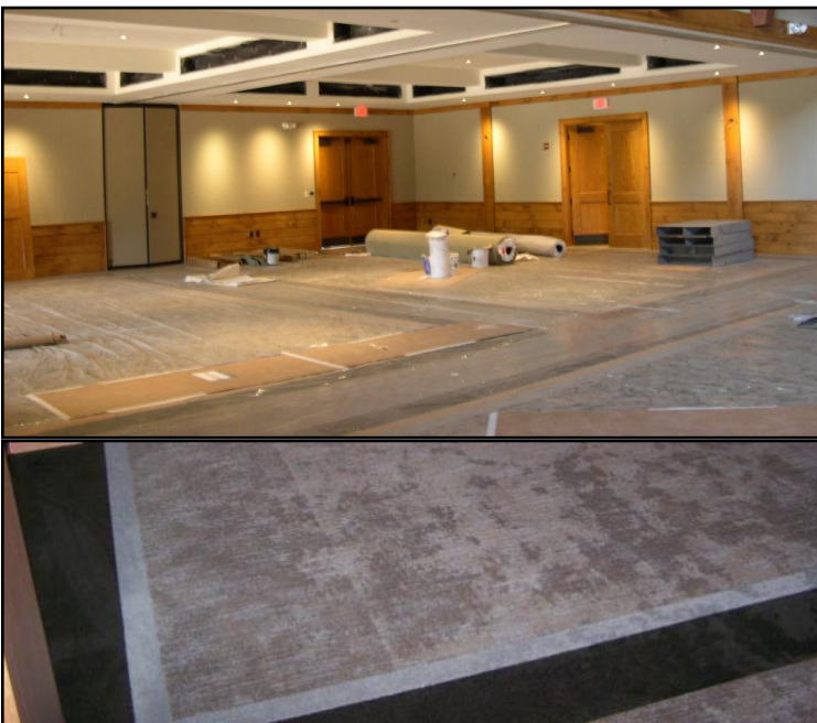
Alternation from Plastic Covering

Covering a woven wool or wool/nylon blend carpet with plastic – especially plastic that has pressure sensitive adhesive on it - immediately after it has been glued to the floor or to a cushion in a double stick installation, will alter the face of the carpet creating a type of pile reversal, distortion or mottling effect. This distortion will not come out. Besides, the pressure sensitive adhesive will adhere to the face fibers and stick them together and also attract soil onto the surface of the carpet; this creates even more problems. The carpet should only be covered with Kraft paper and Masonite sheets, never with any type of plastic.