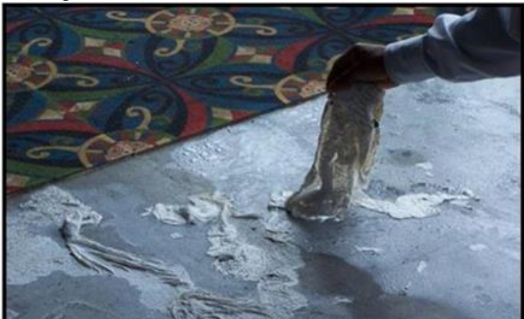
No problem with the slab before but when covered the installation failed

Going over old flooring is another issue that you need to be aware of when on or below grade. The old flooring may have been down for 20 years with no issues or concerns whatsoever so it would seem that because it is secure going over it won't be a problem – not so fast there Sherlock! As soon as you cover that floor you essentially put a vapor retarder over it and any moisture that was escaping all those years before is now trapped, resulting in the old floor and the new one blowing off the slab. If the old floor is Vinyl Asbestos tile with cut back adhesive get ready for some serious pain to follow. Even if not, everything will have to come up and you'll have to start from scratch mitigating the substrate and replacing the flooring material.