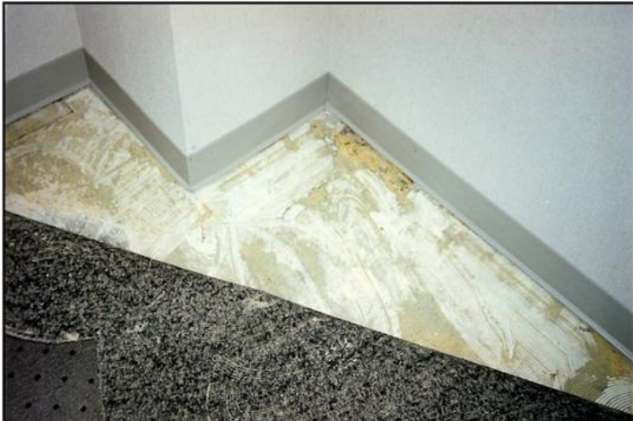
Alkaline Destruction of Adhesive

perimeter of the modular material but it will collect in middle of it which will destroy the adhesive, may compromise the PVC backing or potentially affect the flooring material itself. Typically well-constructed and stable modular carpet tile will resist the effects of moisture but if there is recycled content in the backing the flooring can react by curling. As for other modular flooring materials exhausting moisture or thinking it will and using that as a reason not to mitigate the slab is like saying “if I leave one bullet out of the chamber that should be good enough to prevent someone getting shot when I pull the trigger.” Not a good idea and way to risky – eventually there will be a failure and what you thought was going to be a savings initially will be a major expense later. As for the broadloom breathing, it does as it is permeable but for the moisture to volatize through the carpet it must first come through the adhesive and the alkalinity in the moisture will eventually destroy the adhesive so you can forget about that being a fail-safe installation – it’s not.