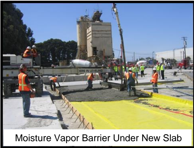
Moisture Vapor Barrier Under New Slab

Aside from testing for moisture in a concrete slab it’s important to know some other critical information. First, does the slab, if on or below grade, have a moisture vapor retarder beneath it and if so what is it and is it wrapped? Chances are if