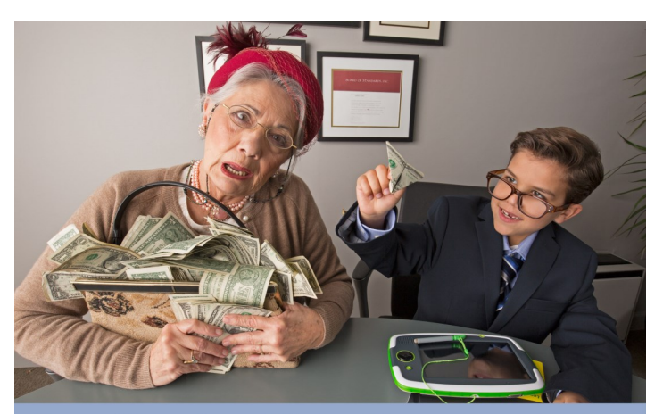
So why wouldn't you call a specialist for your LVT needs?