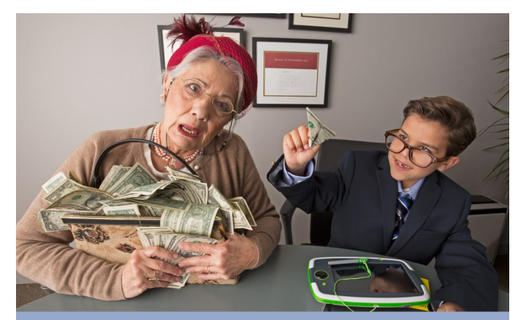
You would never let a child play with your retirement savings. So why wouldn't you call a specialist for your LVT needs?