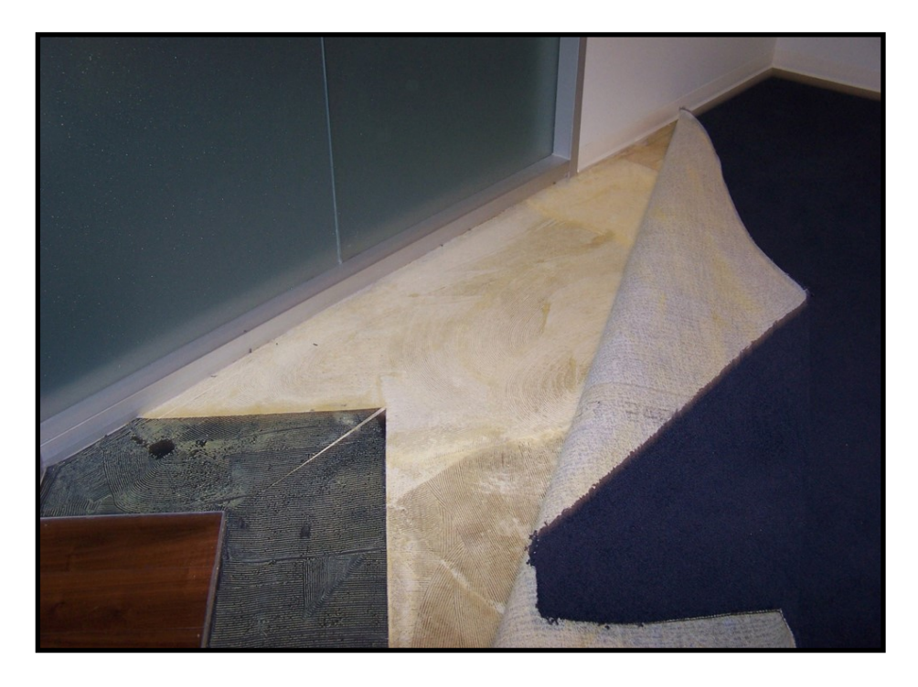
ALKALINE DESTRUCTION OF ADHESIVE

Keeping the flooring industry out of harm's way will be a joint effort installing on concrete in the future. We need to keep asking, "what's in the mix?"