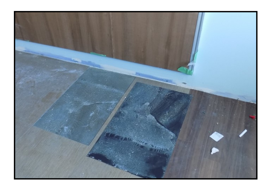
COMPROMISED BOND ON NEW SLAB FROM COMPONENT IN CONCRETE