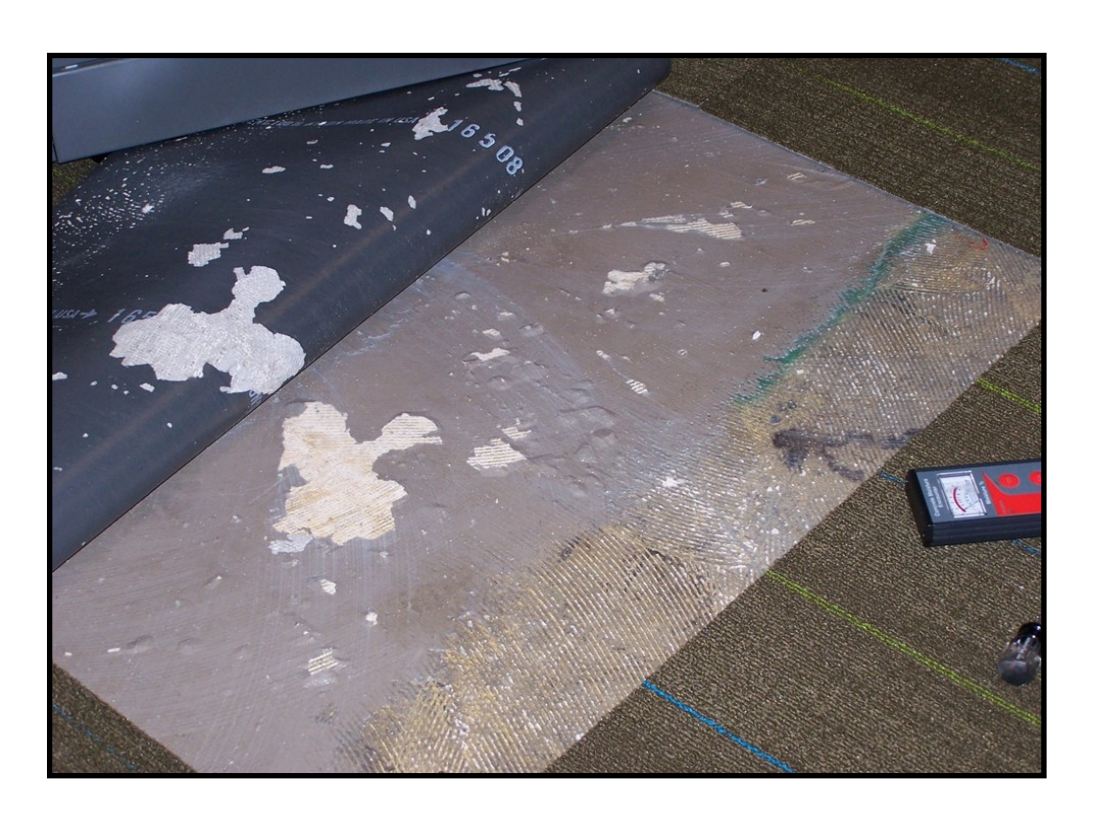
BLISTERING OF COATING ON CONCRETE SLAB