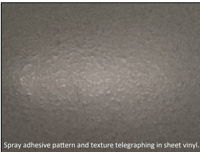
Spray adhesive pattern and texture telegraphing in sheet vinyl.

The first case we'll look at involves the installation of sheet vinyl flooring on several floors of a new building, with the complaint being texturing telegraphing through the face of the material. In this installation, a spray adhesive was used and the flooring subsequently buffed, not