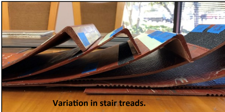
Variation in stair treads.

In another case, the flooring contractor installed stair treads that were not uniformly made and varied significantly in size and shape. The flooring contractor did everything possible to make the stair treads work to no avail. The manufacturer insisted this was an installation issue. The people who were sent to look at the material, on more than one occasion, said this was an installation issue. Had anyone who knew what they were looking at seen the stair treads, they would have known they were inconsistent. This was a material problem and not installation.