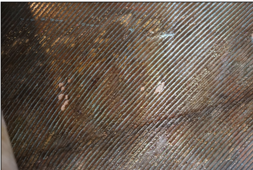
Subfloor with Contaminated Adhesive

Now we come to the case of PVC free backings installed over old adhesives or on substrates that have had several flooring materials installed on them. Several manufacturers have stated that if the substrate contained plasticizers from old flooring installations it would affect the stability of their products. Well, we have more than a few questions about that. How is the flooring installer or contractor supposed to know what was installed before if they didn't do the removal of the existing flooring? If the building is old, it may have had several different flooring materials installed and how is one to know that? And, if the flooring manufacturer says that the old adhesive residue is causing the reaction of the carpet tile, let them prove that it is. In most of these cases when we test the complaint tile, we find that the carpet tile is the problem, not the substrate. Residual Plasticizer on the substrate affecting the new carpet tile? Two of our chemists, that have been in the industry all their lives, chuckled at this. Just how is that supposed to happen?