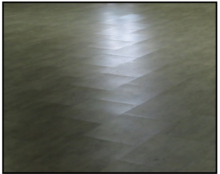
Floating luxury vinyl tiles with edge lift on every tile in a wide open commercial space.