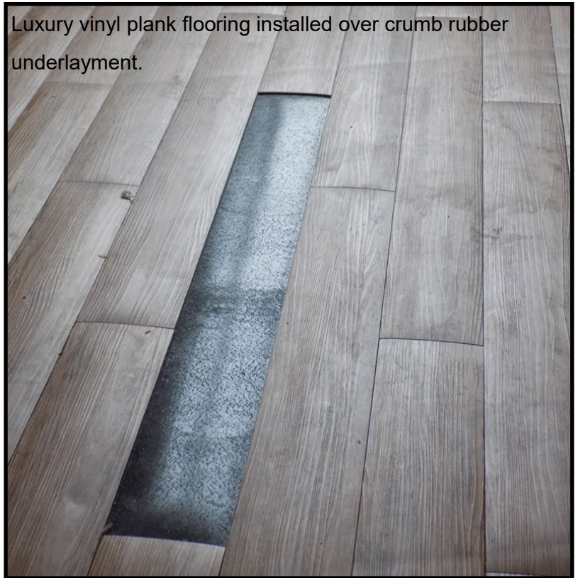
Luxury vinyl plank flooring installed over crumb rubber underlayment.

We’ve been preaching this for some time now and continually have jobs coming in that have failed as a result vinyl flooring (PVC) being installed over crumb rubber underlayment (SBR). These two materials are incompatible and should never be used together. I compliment Shaw for recognizing this and stating it in their installation guidelines. Every manufacturer of vinyl tile and plank should follow suit and adopt the same wording so we can stop the failures and lawsuits of vinyl tile and plank flooring installations over crumb rubber underlayment. And this information needs to be conveyed to the Architects who spec the materials in Division 9 and to the General Contractors.