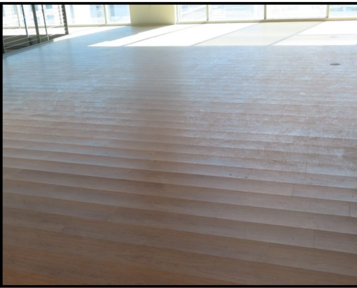
Long, rigid core, vinyl planks with floating installation and every plank cupped before the project was occupied.