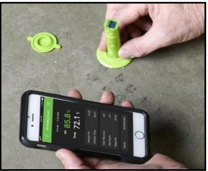
The DataMaster L6 app provides error-free, wireless transfer of your concrete moisture data to your mobile device.