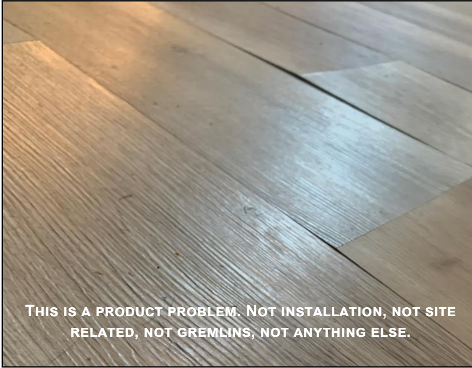
THIS IS A PRODUCT PROBLEM. NOT INSTALLATION, NOT SITE RELATED, NOT GREMLINS, NOT ANYTHING ELSE.

after the product is installed. Korean production is mostly integrated, and those manufacturers typically don't outsource their production. A Large commercial order should be produced at one time and the lots should not be mixed, but this doesn't always happen therefore you can get some materials on a job distorting, lifting or shrinking, have shade or sheen variation in the product or performance issues in the same order. If you understand the manufacturing, logistics and sourcing process of these products, figuring out what's wrong with the product and why will answer the questions for you and help you understand what's going on and why. To determine what's wrong and why, you must know. There can be no guessing or opinions. Too many people who say they know don't. You want someone to help