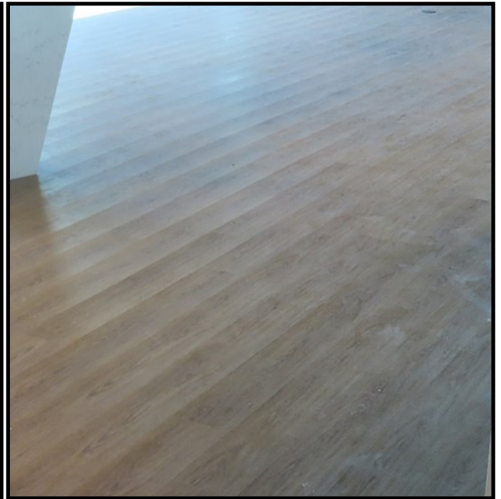
Failed installation due to crumb rubber underlayment (SBR) being used with vinyl plank flooring (PVC)