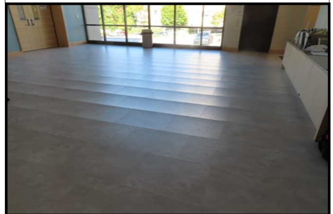
FLOATING VINYL TILE INSTALLATION INSTALLED ON AN OVERWATERED POURED UNDERLAYMENT.