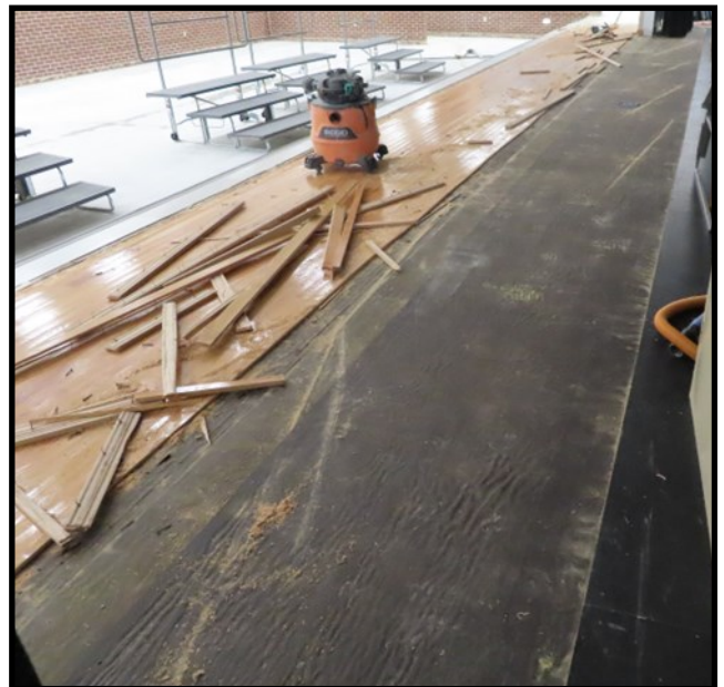
THE WOOD IS CUPPED FROM MOISTURE. IT IS INSTALLED OVER A SLEEPER SYSTEM THAT HAS TAR PAPER, USED AS A MOISTURE BARRIER, ON TOP OF PLYWOOD

Concrete substrates, both above and below grade, are almost always the substrates over which flooring, and installation failures occur, but you can't forget about installations over a variety of different materials. Those materials would include different wood type panels such as plywood. Due to the use of multiple wood veneers in each panel, plywood may contain variations in flatness and thickness. OSB (Oriented Strand Board) Particle board, Lauan, and other wood type panels treated for water resistance or fire resistance may contain, and often do, chemicals that play havoc with adhesives, or poured underlayments, used to