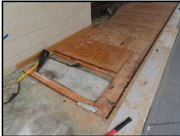
HERE YOU SEE THE PLYWOOD, DARK COLORED DUE TO MOISTURE, WITH TAR PAPER BENEATH IT, OVER THE TOP OF THE CONCRETE, FROM WHICH THE MOISTURE IS COMING. THE TAR PAPER DIDN'T WORK AS A MOISTURE RETARDER. THIS IS A FAILED UNDERLAYMENT SYSTEM.

Another product is raised underlayment panels with wood top and thermoplastic bottom. The purpose of this system is to isolate whatever is beneath them from affecting the flooring installation. We had a project in NYC in a very old building that was seeping water from outside the base of the building, into the concrete slab in several places. The GC thought that, using this type of isolation system, the installer could float