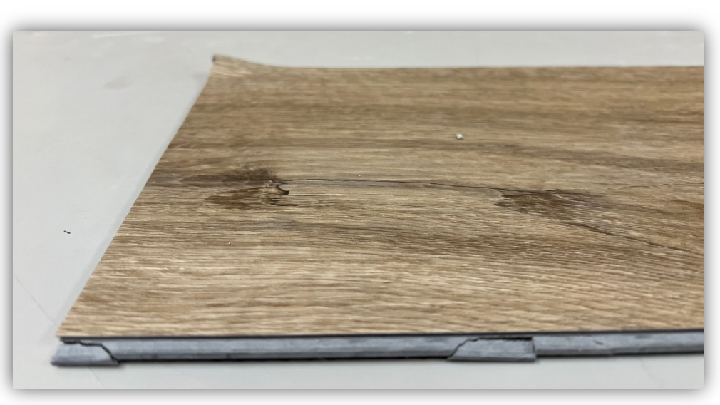
LVP WITH ENGAGEMENT SYSTEM BROKEN AND SURFACE LAYER PEELING OFF

Flooring containing a magnesium oxide core can also be susceptible to reactions of moisture. Testing conducted revealed "pimples" formed in the surface of the flooring from exposure to moisture. Guess who would get blamed for this initially? If you guessed the flooring installer or flooring contractor, you'd be correct.