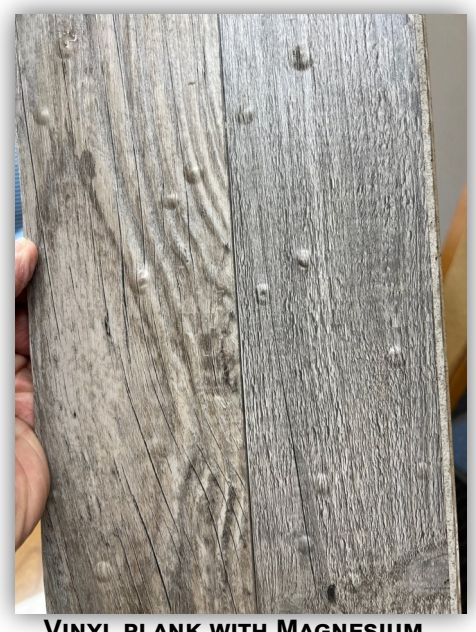
VINYL PLANK WITH MAGNESIUM OXIDE CORE REACTING TO WATER