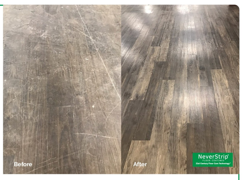
Dallas, Texas office building floor

been protecting all types of noncarpet flooring across North America for over 12 years. These sealers are cost-effective, refreshable, and require no stripping for reapplication.