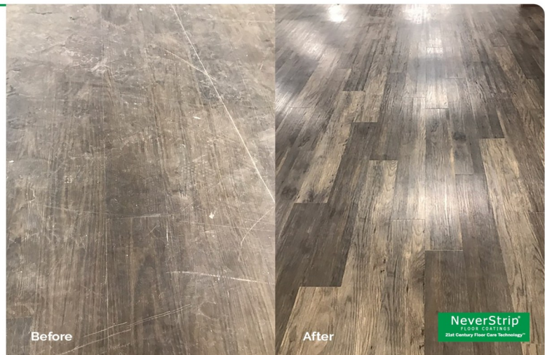
Dallas, Texas office building floor

NeverStrip Micron Sealers have been protecting all types of non-carpet flooring across North America for over 12 years. These sealers are cost-effective, refreshable, and require no stripping for reapplication.