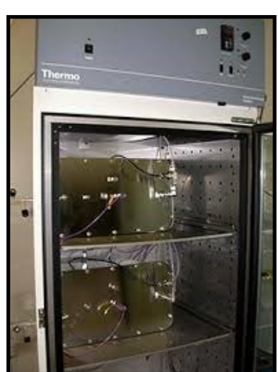
Small Exposure Chamber

LGM is here to help you in whatever way we can to answer your questions, define problems and determine resolutions.