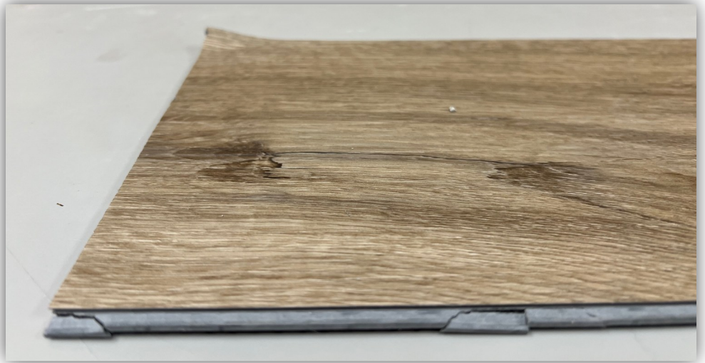
LVP WITH ENGAGEMENT SYSTEM BROKEN AND SURFACE LAYER PEELING OFF

Flooring containing a magnesium oxide core can also be susceptible to reactions of moisture. Testing conducted revealed “pimples” formed in the surface of the flooring from exposure to moisture. Guess who would get blamed for this initially? If you guessed the flooring installer or flooring contractor, you’d be correct.