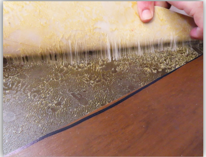
SHEET VINYL—EFFECTS ON ADHESIVE FROM PLASTICIZER MIGRATION

All of us in this industry work with and look at flooring on a daily basis. Did you ever wonder what it's made of and what goes into it to make it? We're talking about a product that employs physics and chemistry, not only in the flooring product itself, but in all the products that are associated with it. These would include floor prep and treatment products, adhesives, sealers, cleaners, the substrates the products go on or anything else you can think of. All chemistry. How do these chemicals interact with each other or within the product itself is one of the things we'll touch on as well as some other interesting stuff we get involved with.