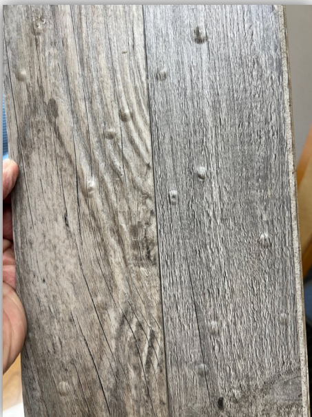
VINYL PLANK WITH MAGNESIUM OXIDE CORE REACTING TO WATER