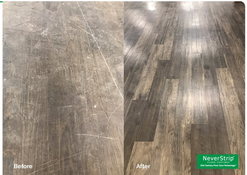
Dallas, Texas office building floor

NeverStrip Micron Sealers have been protecting all types of non-carpet flooring across North America for over 12 years. These sealers are cost-effective, refreshable, and require no stripping for reapplication.